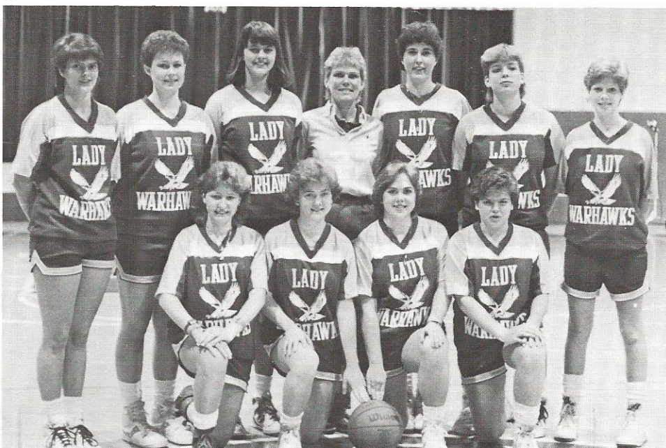
The 1987 Hawks are "one big HAPPY family" both on and off the court.