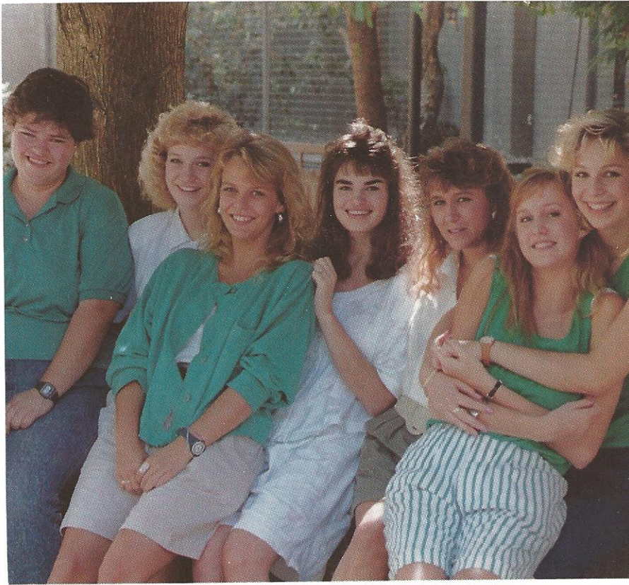
The friendship between these girls will last forever because it will never be forgotten.