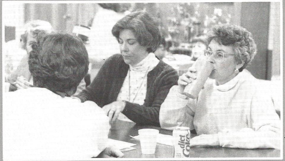
All teachers look forward to lunch even if lunchroom duty is involved.

Students often have problems with their work or maybe a personal problem. The teachers are always willing to help during class, study hall or after school if necessary. Teachers help students prepare for the road ahead, but the teachers at John C. do it better than the rest — they care!