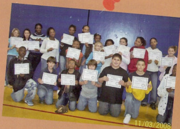
1st Quarter Honor Roll