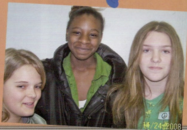
October Students of the Month