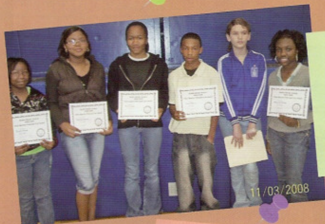
1st Quarter Principal's List