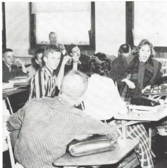
Let's hear it!

An active Student Council? You bet! This year's council worked particularly hard on new activities.