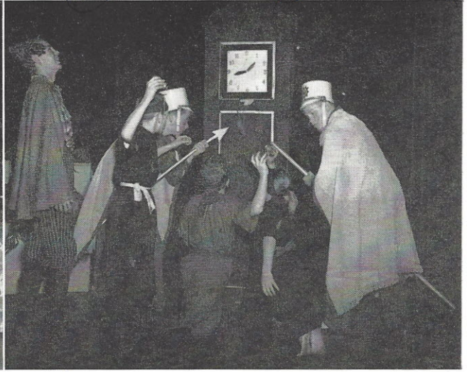
"The Clock Struck One"