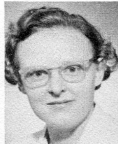
Mrs. M. S. Johnson Junior High