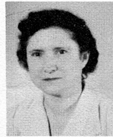
Mrs. L. D. Goodwin Junior High