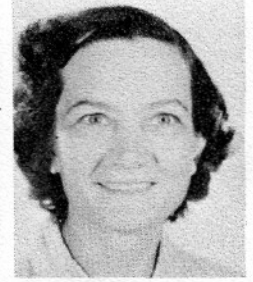
Mrs. I. Buckwalter Junior High