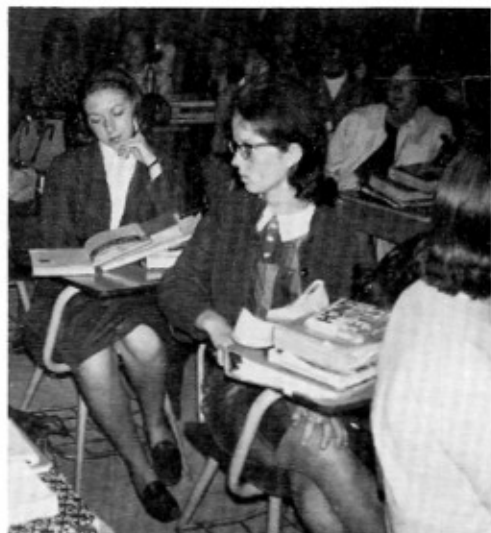
Oh, those irregular verbs!

The French Club, formed to increase the students' appreciation of the language, acquaints its members with French literature and customs. The members enjoy varied experiences in programs that have an interest for all.