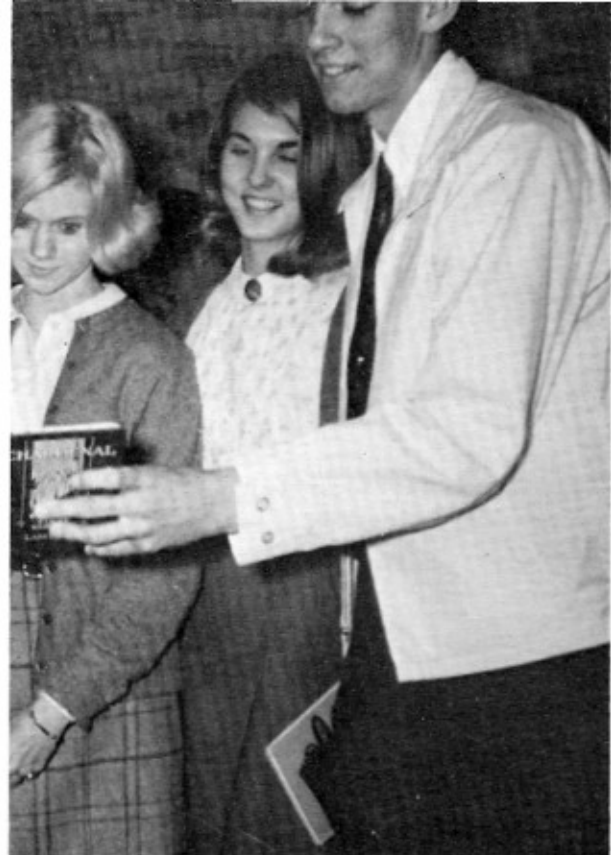
Can't somebody read today's lesson?