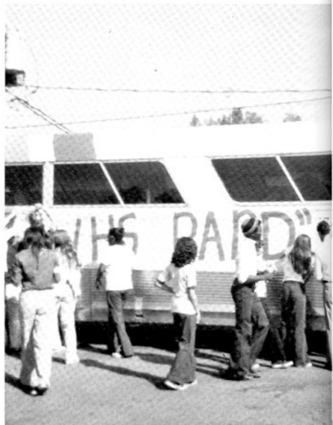
Before getting on the road to Gaffney, WHS Band members make certain they will be identified by all they meet.

The band did not stop working after football season was over. In January, students attended the solo and ensemble festival in Columbia. In February, Band students tried out for All-State Band, attended the Eastern Region Band Clinic, and presented a Pops Concert. In March they hosted Clark Terry (one of the finest trumpeters in the world), attended the All-State Band Clinic at Furman University; tried out for Edisto Conference Band and attended the Edisto Conference Band Clinic. April saw the band make its second spring trip to Disney World, while May brought the Spring Concert and Graduation exercises.