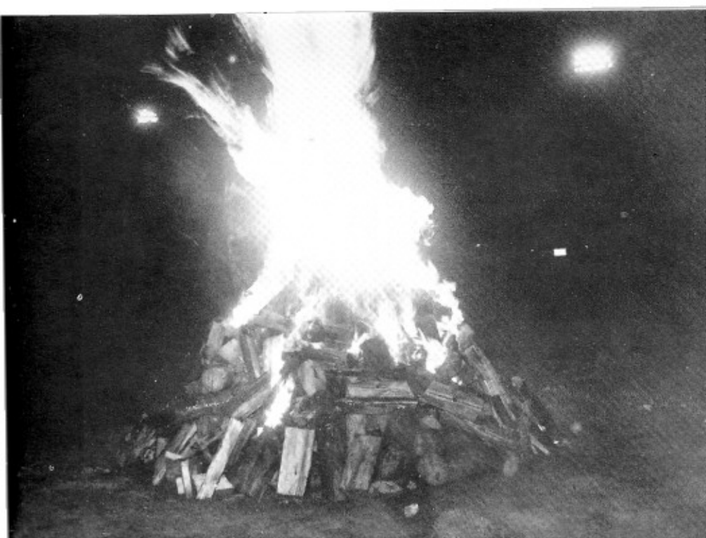
Above: It couldn't be a Bonfire without a fire could it?