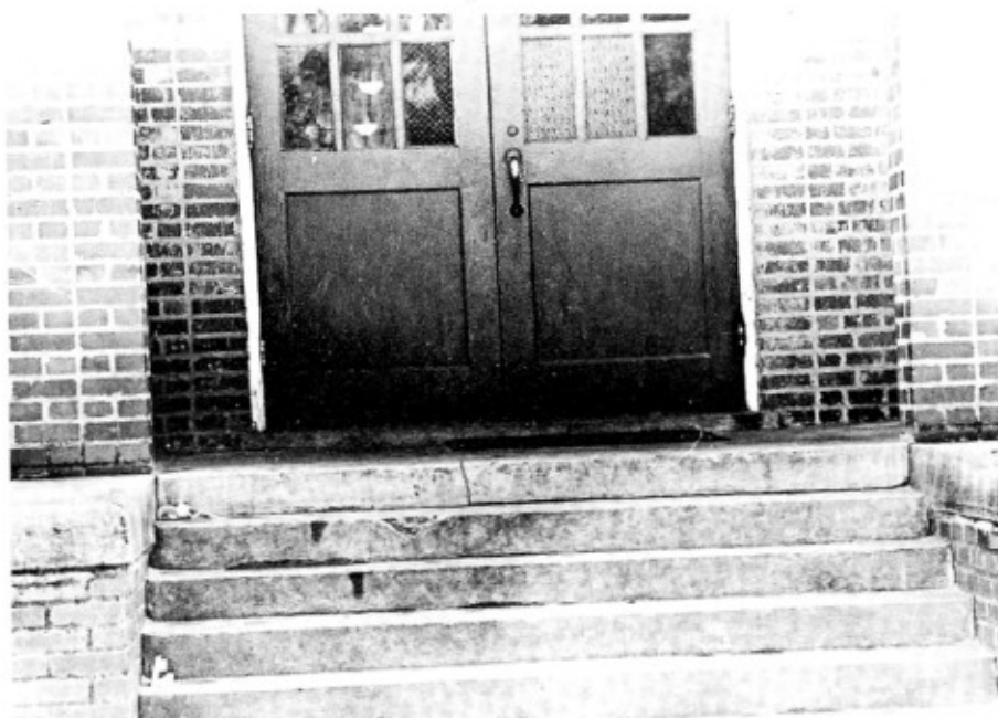
Looking very lonely are the front steps where students sat.