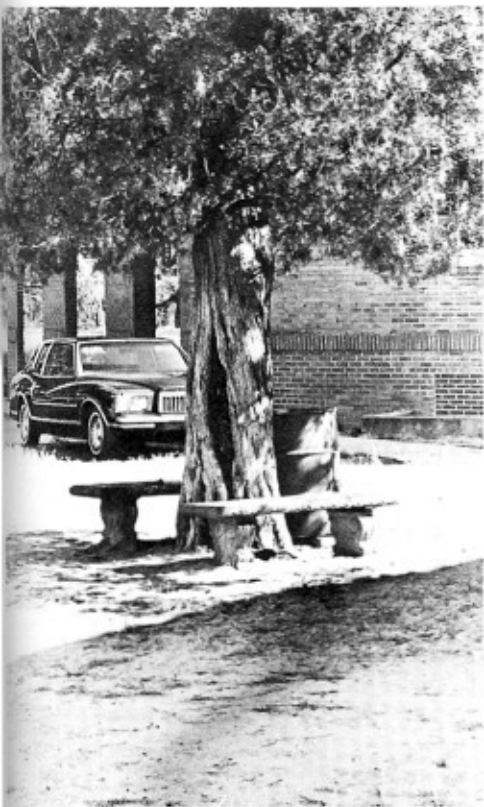
Looking very deserted is the tree where everyone smoked or talked.