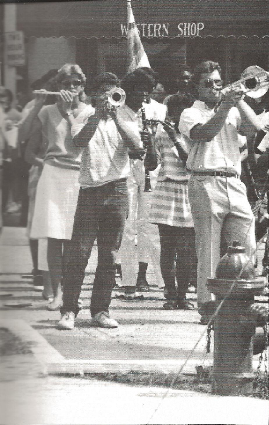
THE BAND OF BLUE performs for the downtown plaza dedication before the August opening of Colleton County Schools. Their performance benefited from the four weeks of dedicated summer band camp practice.