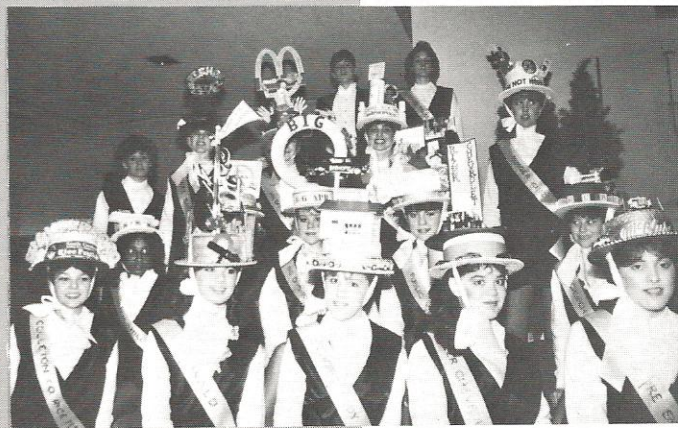
WEARING THEIR HOME MADE HATS are the 1986 Living Ads.