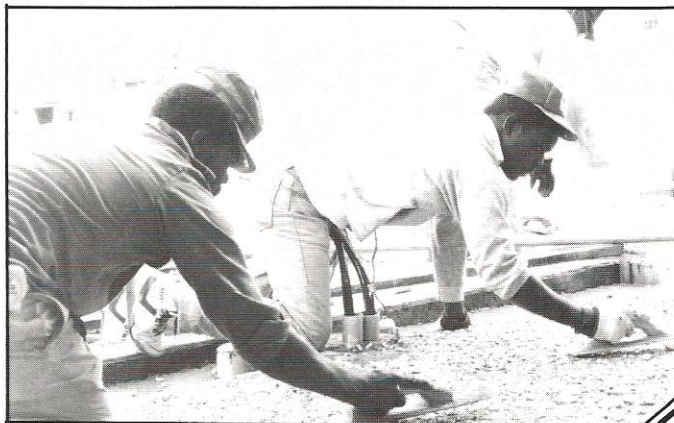
The construction workers crunch the oyster shells into place in the wet cement on a cool April afternoon.