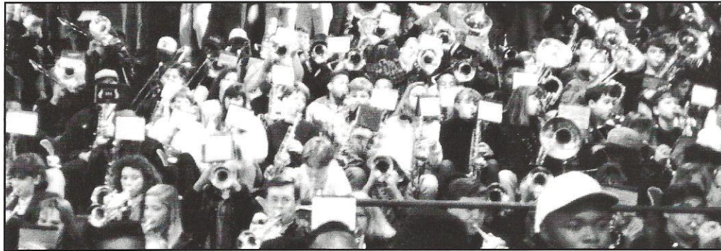
Band of Blue members perform at a pep rally. The Band was awarded the State title in 4A division for the third consecutive year.