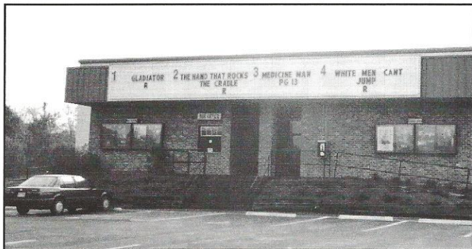
The newly opened Ivanhoe Cinema is one of the popular hangouts. The Cinema provided all the new hit movies.