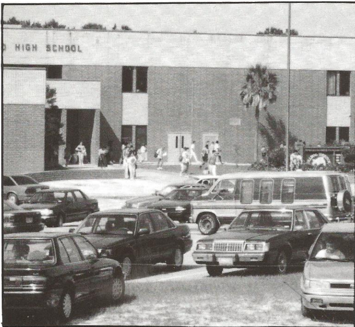
Students pour out of the building at the 3:10 dismissal bell. Many students had their cars "bulldogged" during the year when they parked in the teachers' parking lot.

One dilemma facing students was how to get to school and back home. They could drive, catch a ride with someone else, or ride the bus.