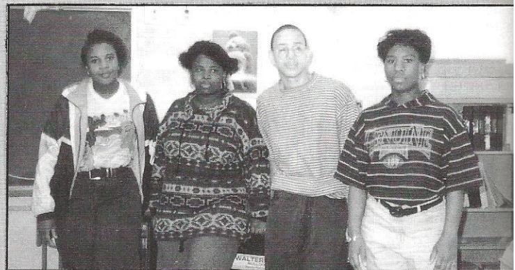
Future Homemakers of America