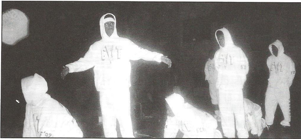
STEP TO THE BEAT . . . Covert members provide entertainment during one of their talent shows.