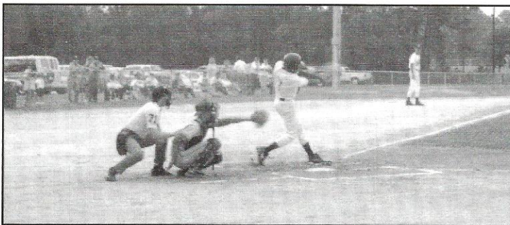
Swing for the fences. AWH's batter takes aim at the fences during a game. Hitting was a strong part of the Bulldogs' game.