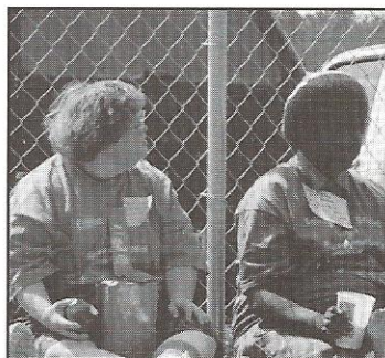
Taking a Break. Two Walterboro participants take a moment to enjoy the lunches that were provided.

For the opening festivities, three parachuters landed in the middle of the track and two participants and a member of the Civitans Club lit the torch. While waiting for their events