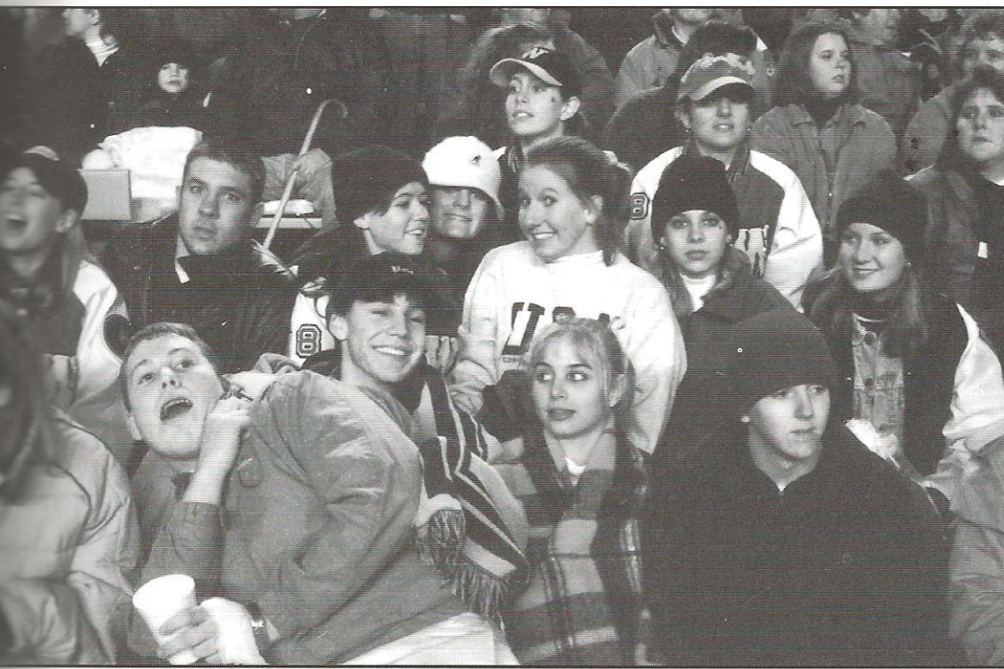
Just how cold are you? Cheering for their team, the state crowd sports many brands. From Adidas, Polo, and sock hats to plaid blankets and letter jackets, everyone was dressed for warmth, as this game was one of the coldest of the season.