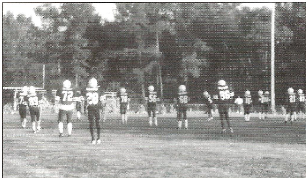
Momma always said practice makes perfect! Junior Varsity football players are shown here practicing and stretching at the Walterboro High School Football Stadium before the game. The coaches often managed to squeeze in one last quick practice before the games were set to start.